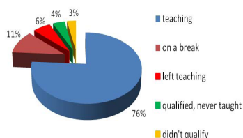
Teaching pathway percentages

People who did not complete their teaching qualification, usually stated reasons such as health, financial difficulties, being unsuited to teaching, birth of a child, and interest in other fields.