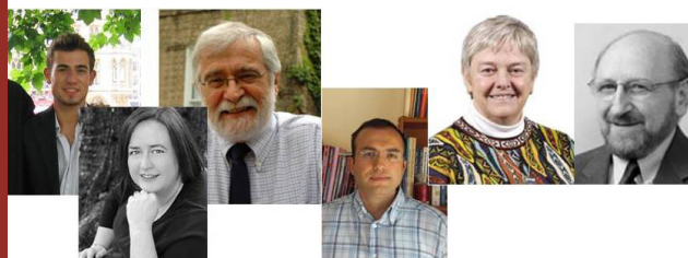
Collaborators from Cambridge U.K., Ahi Evran Turkey, and Michigan USA

The cross-cultural comparisons provide wonderful "natural experiments", to contrast the impact of salient cultural features. As two topical examples, teachers in Germany are better paid; and, there is an over-supply of applicants to teacher education programs in Turkey. We will be able to explore how salary impacts decisions about teaching in Germany vs. Australia, and why teaching seems to be a more attractive career in Turkey.