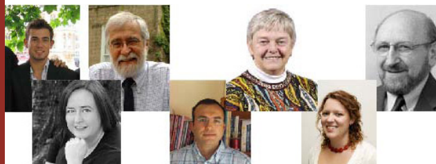
Collaborators from Cambridge U.K., Ahi Evran Turkey, and Michigan USA

The cross-cultural comparisons provide wonderful "natural experiments", to contrast the impact of salient cultural features. As two topical examples, teachers in Germany are better paid; and, there is an over-supply of applicants to teacher education programs in Turkey. We will be able to explore how salary impacts decisions about teaching in Germany vs. the U.S. and Australia, and why teaching seems to be a more attractive career in Turkey.